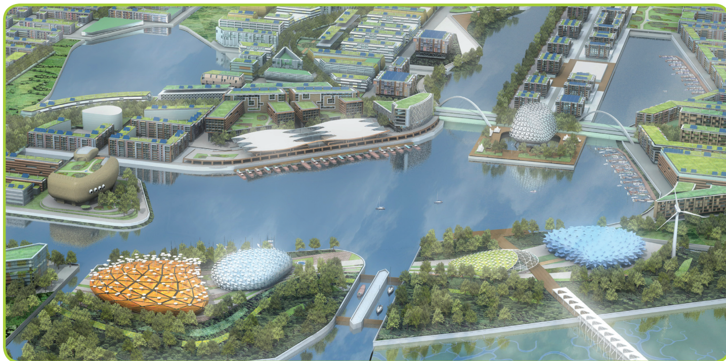
Above Artist's impression of Dongtan eco-city, designed by Arup